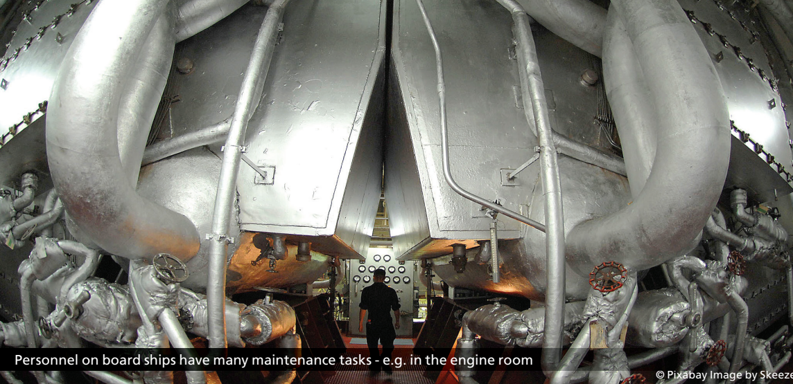
Personnel on board ships have many maintenance tasks - e.g. in the engine room