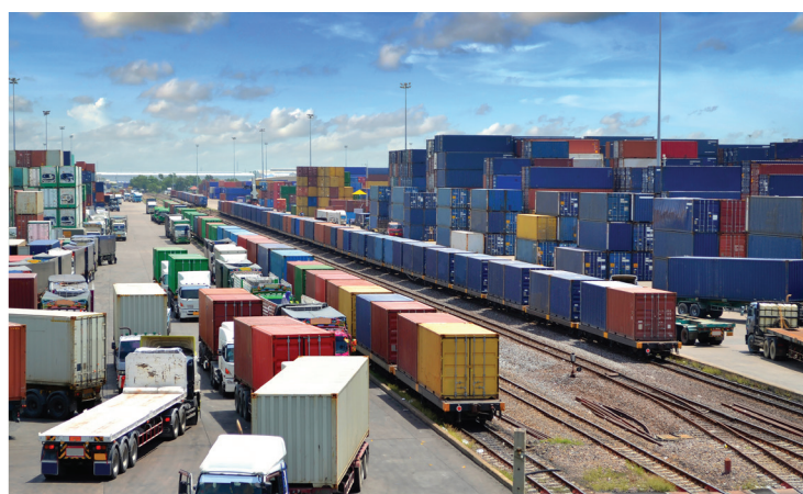
Millions of containers cross the borders in seaports

work will help customs in the future to analyse the need for container NII, design integrated NII solutions and provide answers to important functional and safety issues.